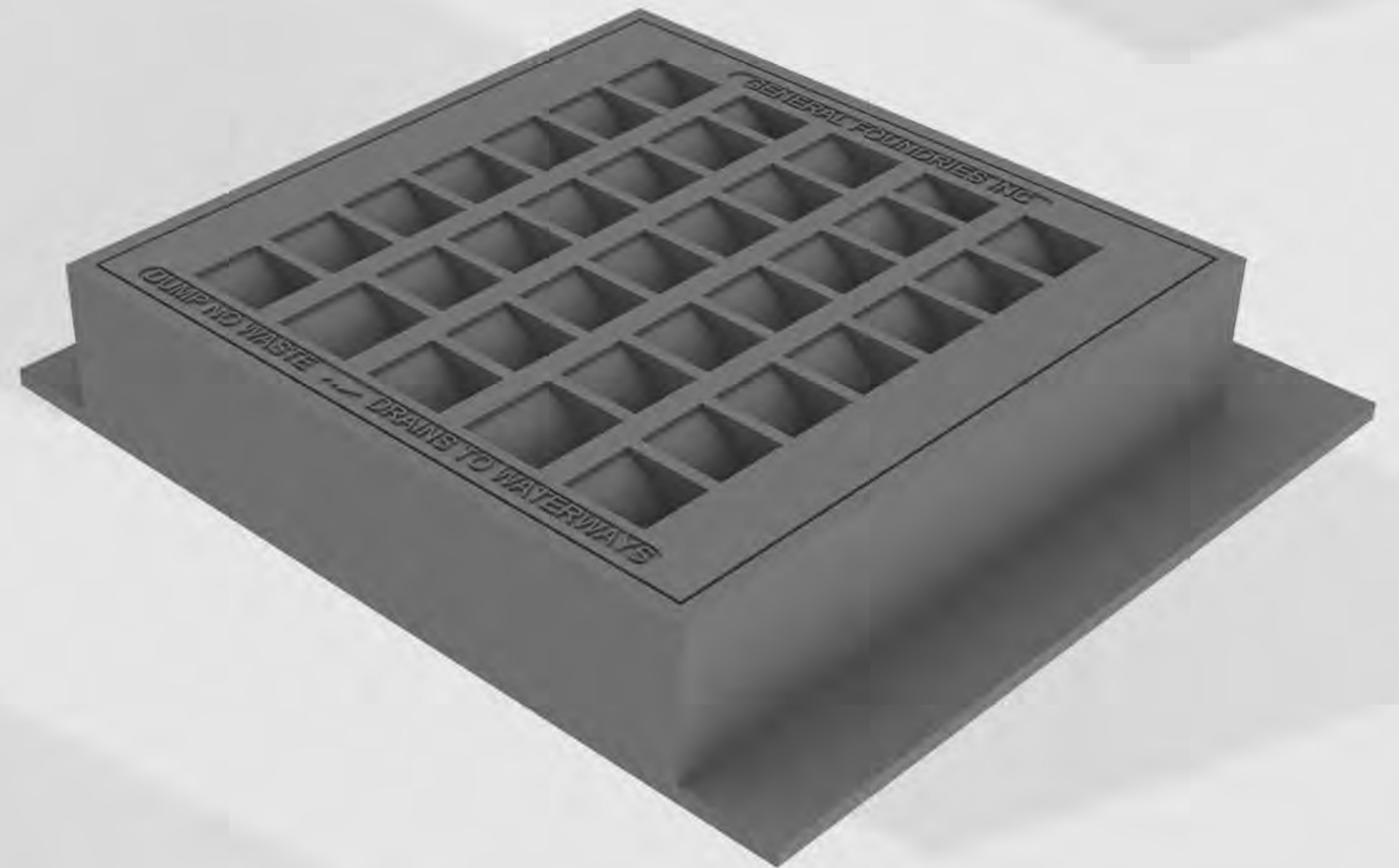
3 FLANGE FRAME WITH CASCADE GRATE