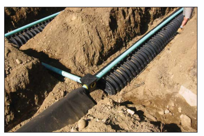
Septic leachfield using CULTEC chambers in pipe distribution system.