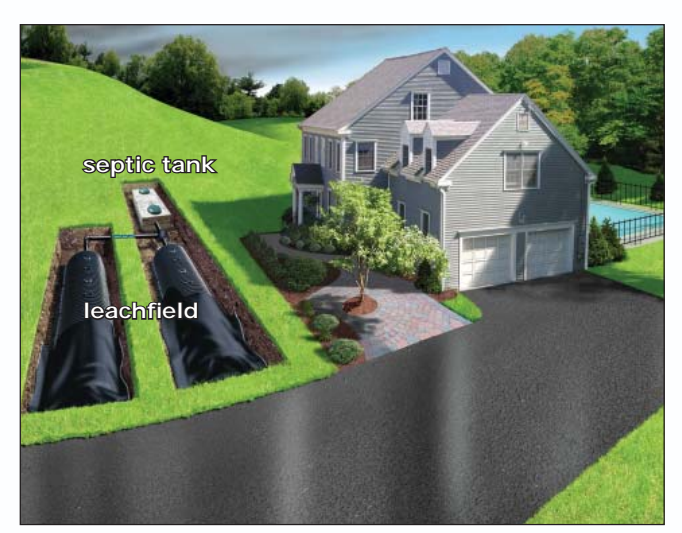
Septic tank and leachfield using CULTEC chambers.