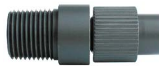
1/2" MPT x 3/8" or 1/2" PE Tubing Connector