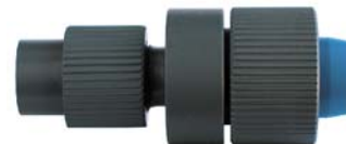
3/8" PE Tubing Adaptor