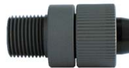
1/2" MNPT Tubing Connector