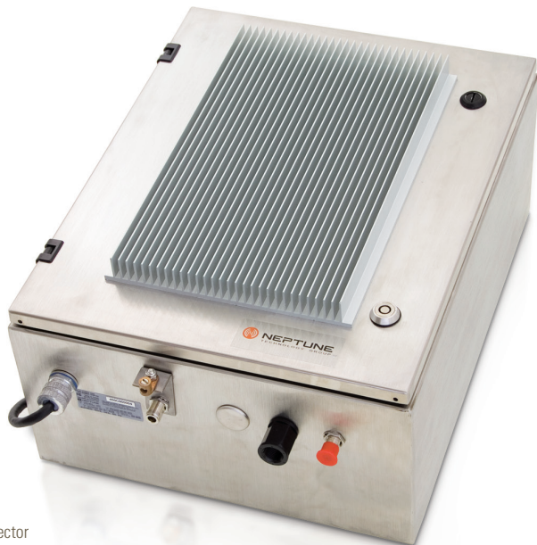
R450 Data Collector

Neptune's R450™ System is an advanced, highly robust, two-way fixed network meter reading solution that delivers comprehensive usage information through a secure, long-range wireless network. The R450 System provides the timely, high-resolution meter reading that enables water utilities to eliminate on-site visits and estimated reads, reduce theft and loss, implement time-of-use billing, and profit from all of the financial and operational benefits of fixed network automated reading and billing.