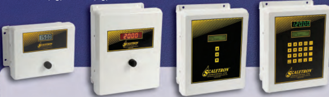
3-1/2 Digit Indicator (Standard)