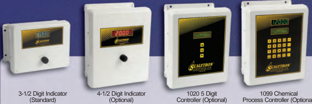
3-1/2 Digit Indicator (Standard)