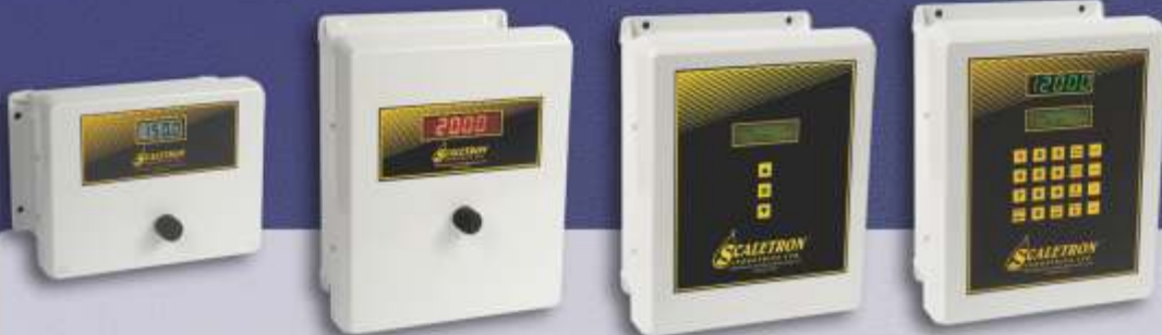
3-1/2 Digit Controller (Standard)