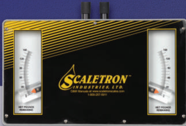
Dual Mechanical Dials (Standard)