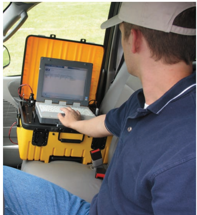
ARB N_SIGHT seamlessly supports meter reading information collected from the MRX920™ (shown)/MTX950™ mobile data collectors. Route information is transferred from the MRX920 to ARB N_SIGHT using a USB flash drive.

ARB N_SIGHT is an adaptable, cost-effective meter reading software solution designed to maximize revenues for multi-utility applications. Neptune designed ARB N_SIGHT Mobile to provide the highest level of data integrity and system integrity to the utility industry. Neptune's ARB N_SIGHT Mobile allows you the freedom to mix and match various elements of data collection technologies from mobile to hybrid systems in one powerful integrated system.