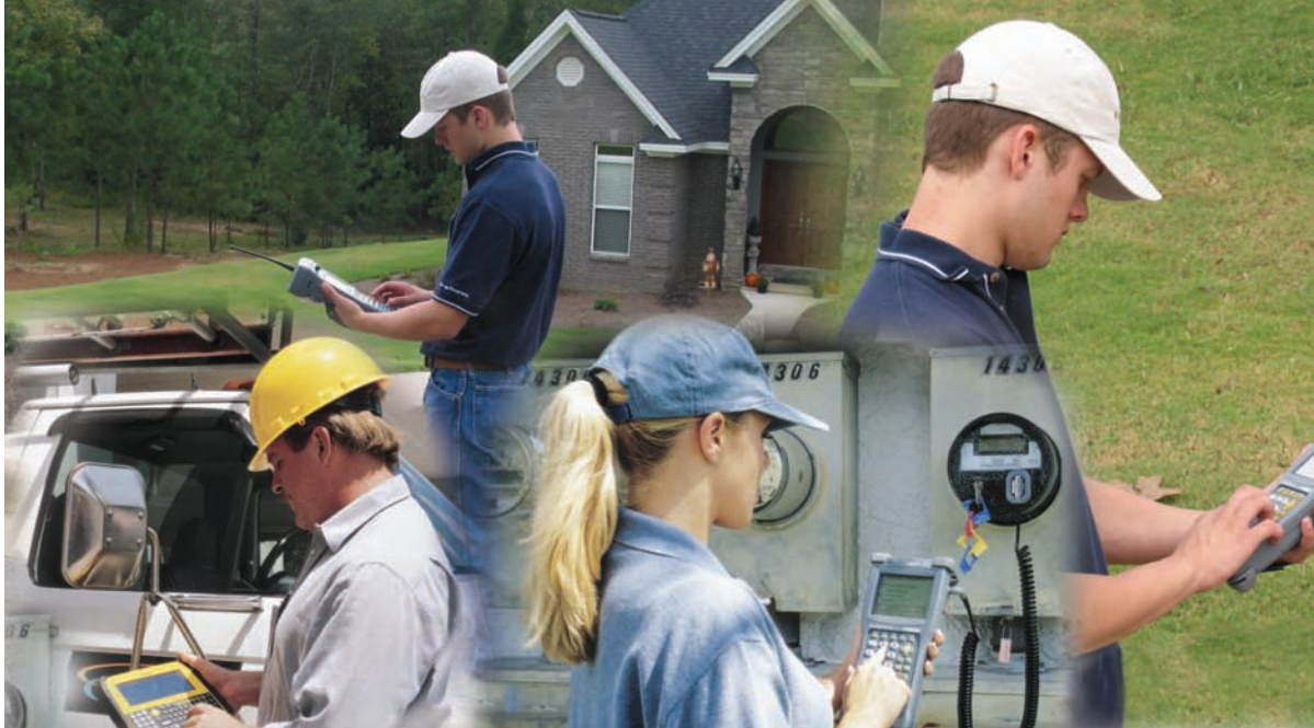
ARB N_SIGHT (1) supports both DOS and Windows CE handheld computers; (2) safeguards previous investments; and (3) is open to future technologies.

ARB N_SIGHT Mobile software offers the following functionalities: